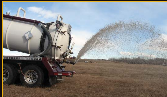
Field spreading can be controlled wirelessly from the cab.