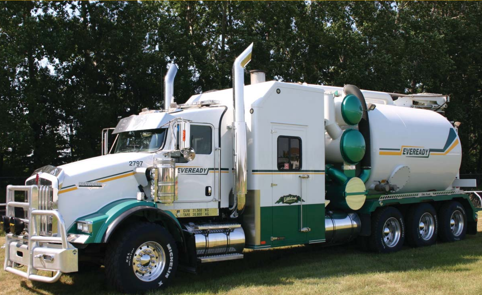
Tornado F4 Hydrovac custom built for Eveready Industries