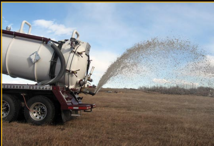
Field spreading can be controlled wirelessly from the cab.